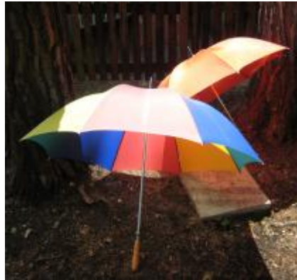
Brollies at the ready but thankfully not needed

The day was well supported by members and ten locomotives were run (c.f. twelve last year when the two C19s ran).